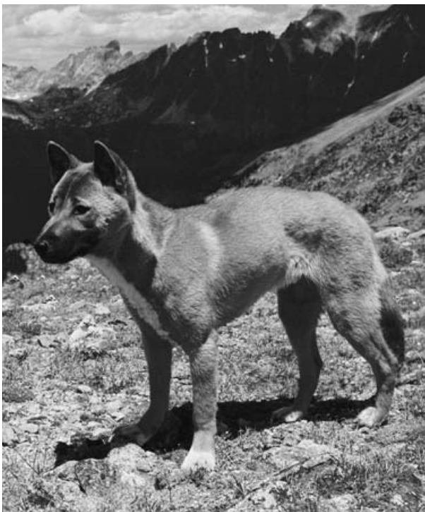
Fig. 1. A typical young adult male New Guinea singing dog Canis hallstromi in the North American captive population.

population: brown; black with tan on muzzle, legs, vent; sable (brown with heavy overlay of dark-tipped guard hairs). Only the brown variety was available for detailed